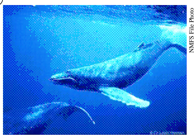
Humpback whales usually dive underwater for 3-5 minutes.

How did the humpback whale get its name? The humpback whale gets its name from fact that the dorsal fin sits on a large "hump" on the back, which is noticeable when the whale arches its back and dives. The scientific name, Megaptera novaeangliae , means "big wing of New England." The "big wing" refers to the humpback's very long flippers, which can be one-third of its body length.