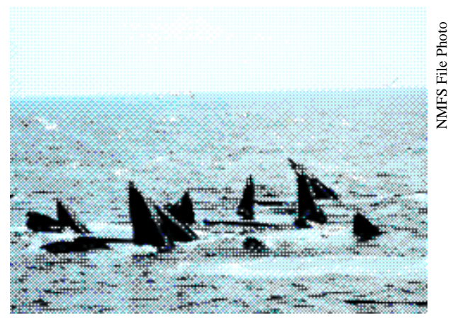
Humpback whales can form groups to feed.

Humpback whales can be found in all the world's oceans. They mostly live in coastal and continental shelf waters, though they sometimes feed around seamounts and migrate through deep water. Every year, they follow a regular migration route from warm waters to cold waters and back. Some humpback whales make a round trip journey of 10,000 miles!