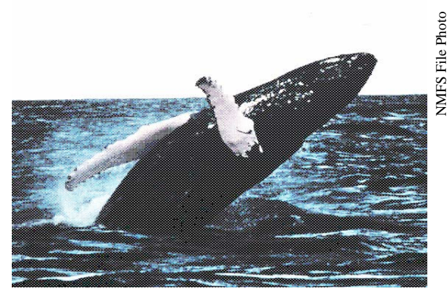
A common behavior of a humpback whale is breaching.

In the summer, humpback whales live in temperate waters where they feed. In the winter, they move to tropical waters where they mate and give birth.