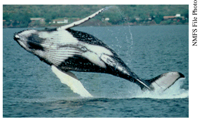
Humpback whales can rise high out of the water when breaching.

http://birds.cornell.edu/BRP/ SoundsHBWhale.html