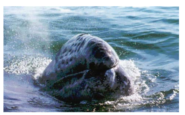
All whales need to come to the surface of the water to breathe.

Gray whales generally reach sexual maturity when they are between 6 and 12 years old. After that they begin mating and calving. A female will give birth to a single calf every 2-3 years, on average. Gray whales mate during the winter or early spring. The gestation period is between 12 and 13 months, but scientists believe the calf does not grow any more in the last month before it is born. The calves are born in winter and are independent of the mother after only 7-9 months. The calves will drink 50-80 lbs (22-36 kg) of the mother's milk every day!